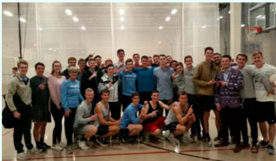
The house volleyball team celebrates the championship win