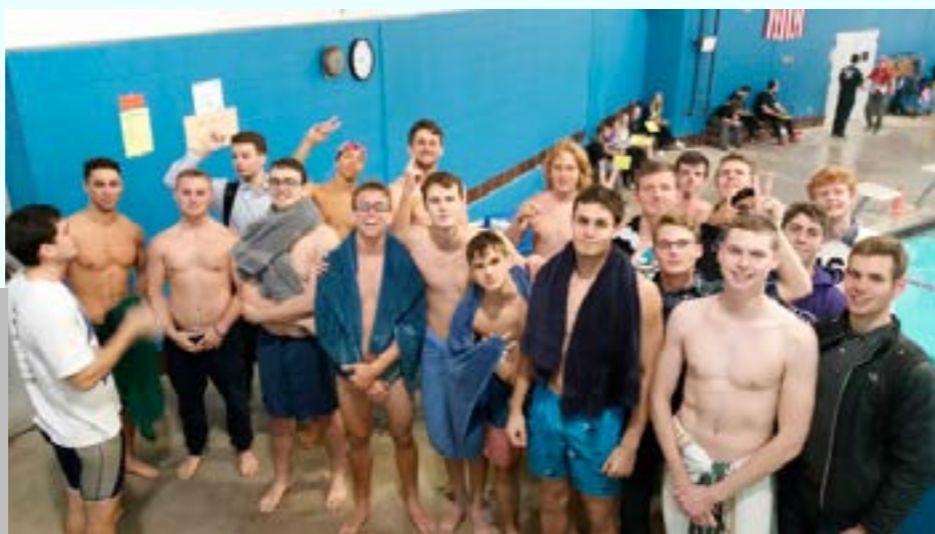
The house swim team revels in placing first in the swim meet